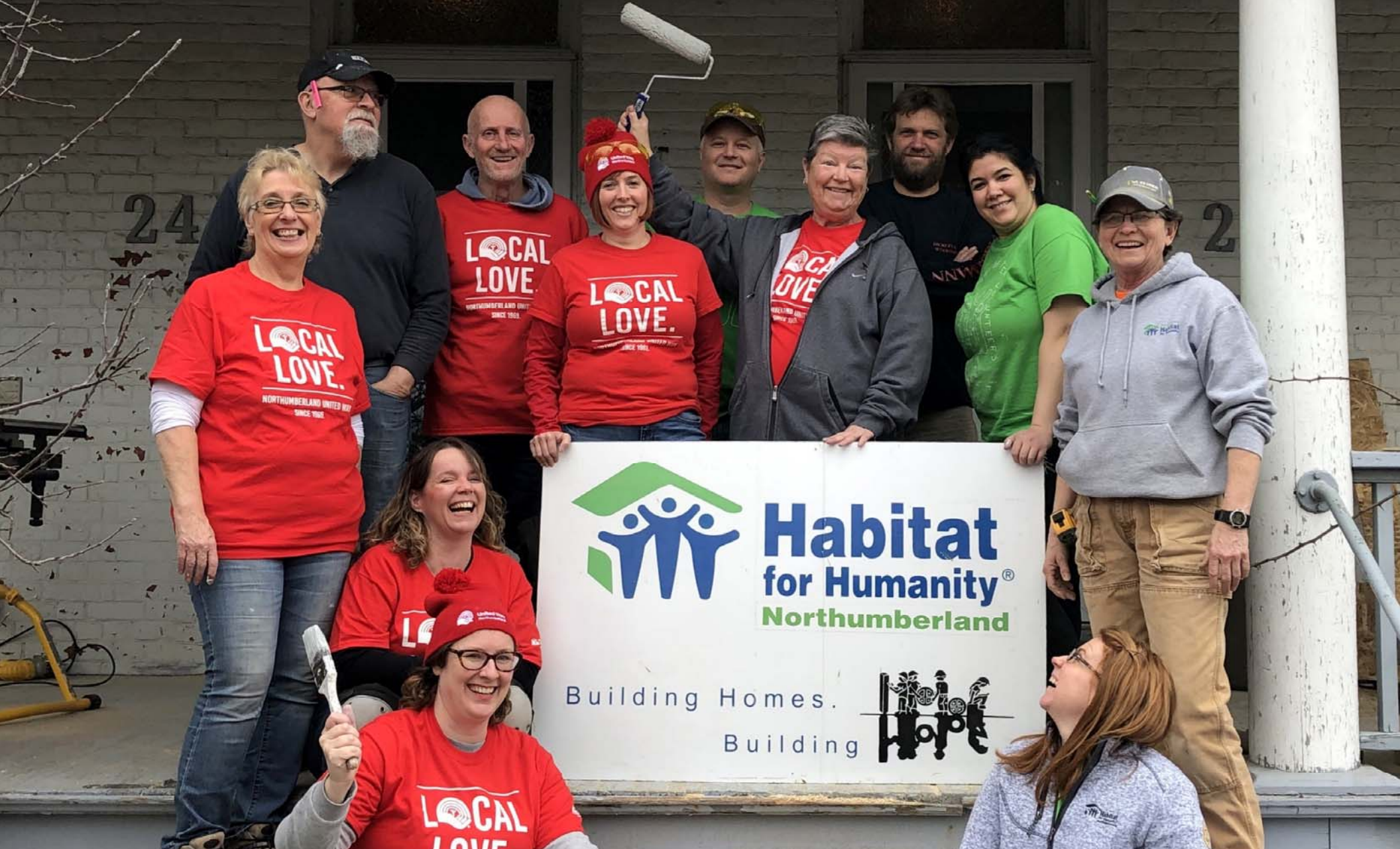
The Northumberland United Way frequently donates their time and resources to help us build houses in Northumberland County for families to call home.